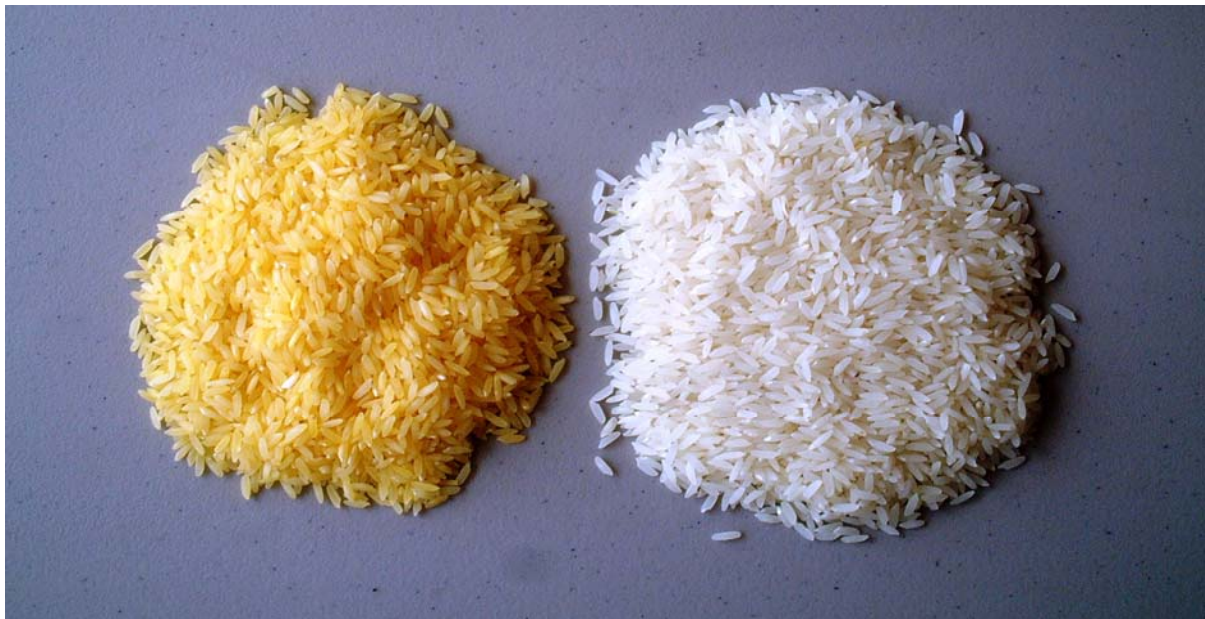
Figure 1. The Golden Rice

In the year 2000, almost 800 million people in 98 developing countries did not get enough food to lead a normal, healthy and active life, as estimated by the UN's Food and Agriculture Organisation (FAO). Around eleven million children die of malnutrition every year; a vast majority of those deaths are linked to micronutrient deficiencies. Nutritional deficiencies with the highest impact on susceptibility to disease and mortality are related to the lack of iron, zinc, iodine and vitamin A. At its inception, the Golden Rice Project set out to alleviate the vitamin A deficiency (VAD) problem, because of its relevance and potential impact. Yearly, half a million people—mainly children—become blind as a consequence of VAD, fifty percent of whom die within a year of becoming blind. VAD severely affects the immune system; hence it is