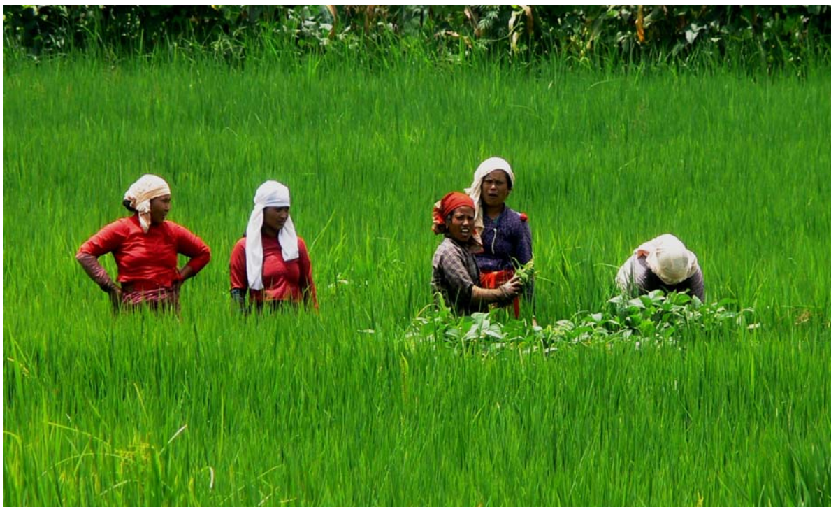
Figure 3. Women in one of Nepal's rice-fields.

More than 20 years of experience using genetically modified plants worldwide, covering more than 90 million hectares in 2005, have not resulted in one single mishap related to damage to health or the environment. Thousands of carefully conducted biosafety experiments have been carried out by prestigious institutions, and all results lead to the conclusion that there is no specific risk associated with the technology, beyond that inherent to traditional plant breeding or natural evolution.