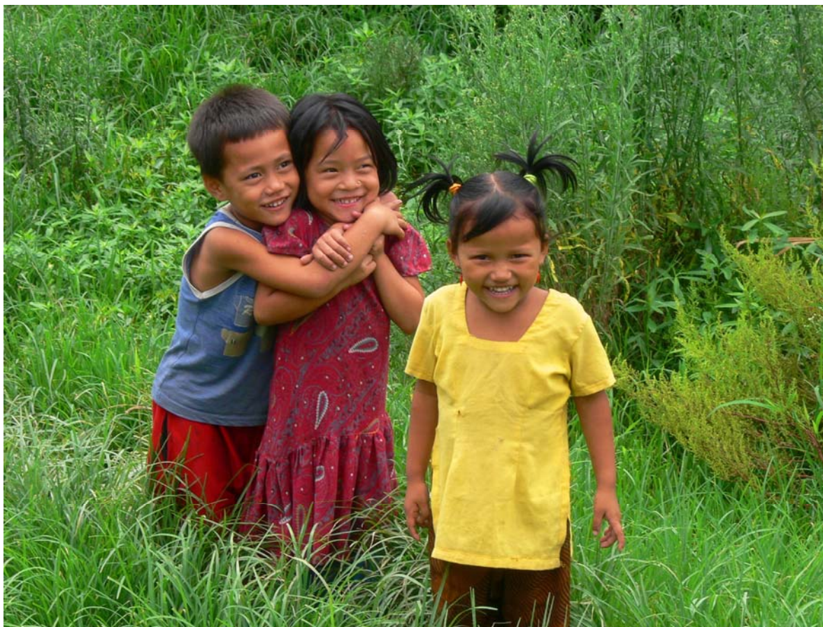
Figure 2. Children in Nepal.

The unpolished rice grain contains other valuable nutrients, like vitamin B and essential fats. It is the latter that makes it usually necessary to polish the rice grain, as the fats may become rancid by oxidation after long storage, thus affecting the taste of the grain.